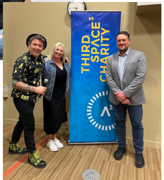
Art on the Line fundraiser at UBCO