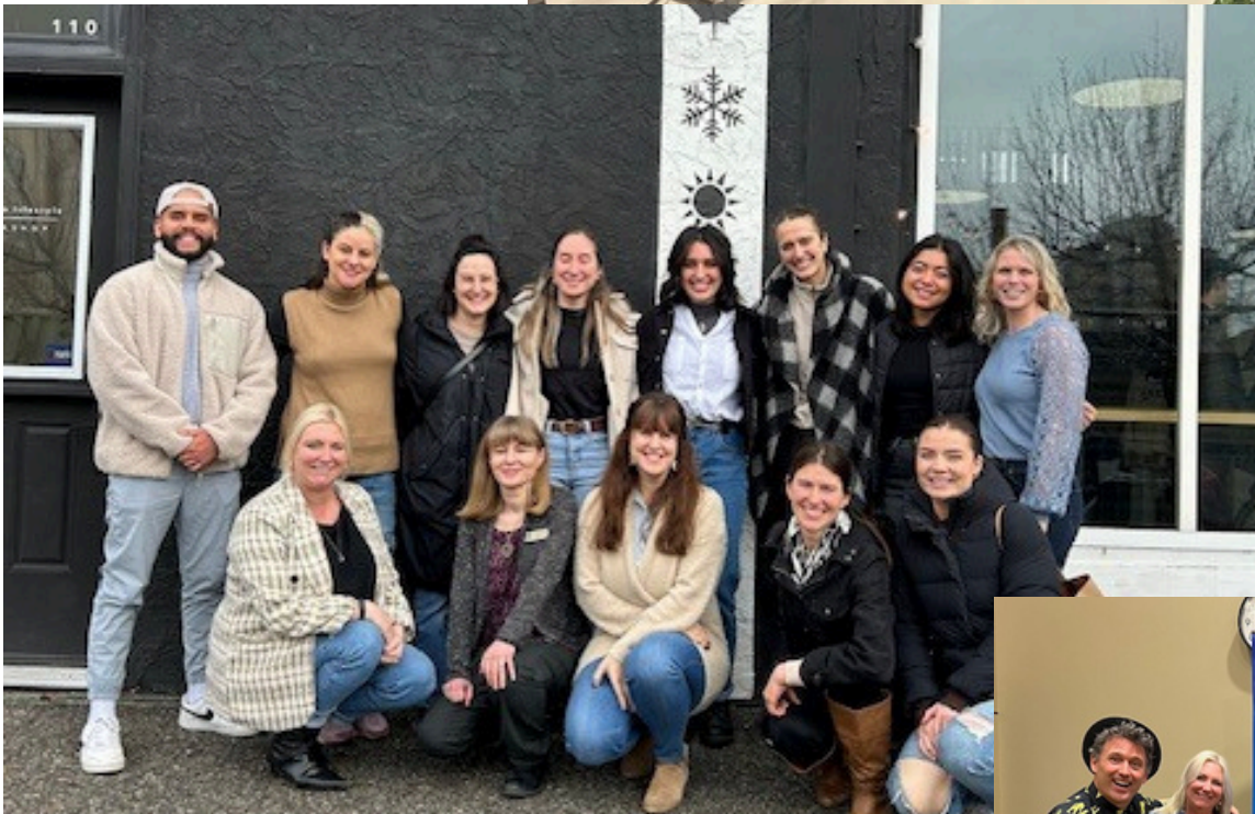
Our team at Okanagan Lifestyle learning about Ableism and Disability.