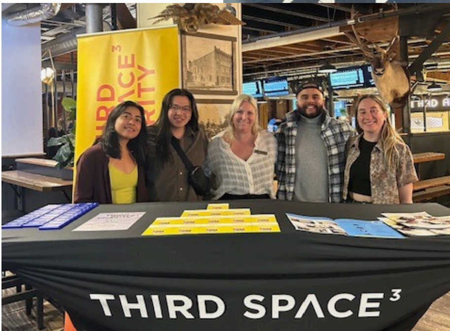
The team at BNA for Pins for Purpose.